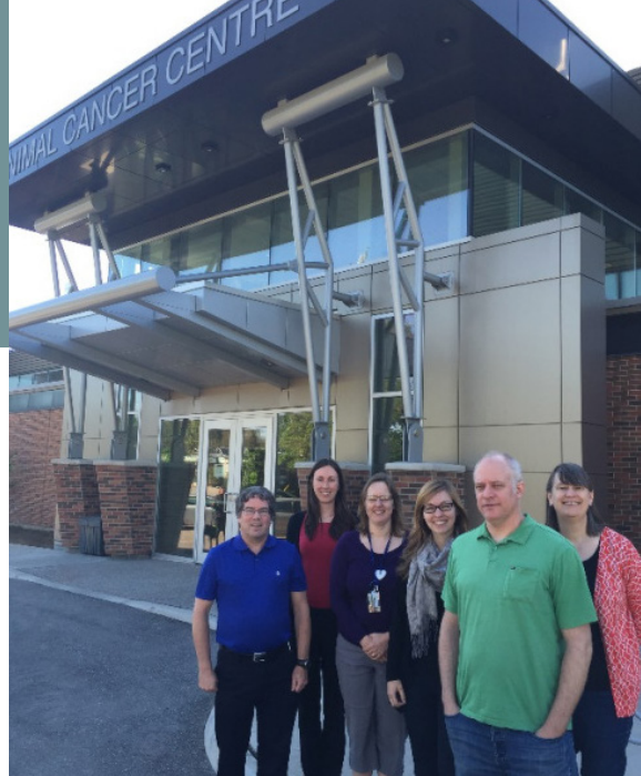
The Institute for Comparative Cancer Investigation team.

Blood samples from oncology patients are also being banked now, regardless of whether a patient is a surgical candidate.