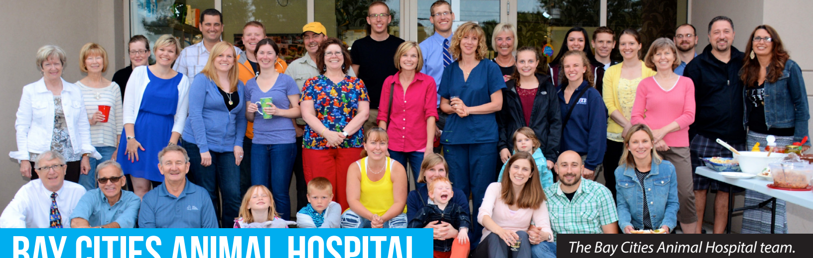
The Bay Cities Animal Hospital team.