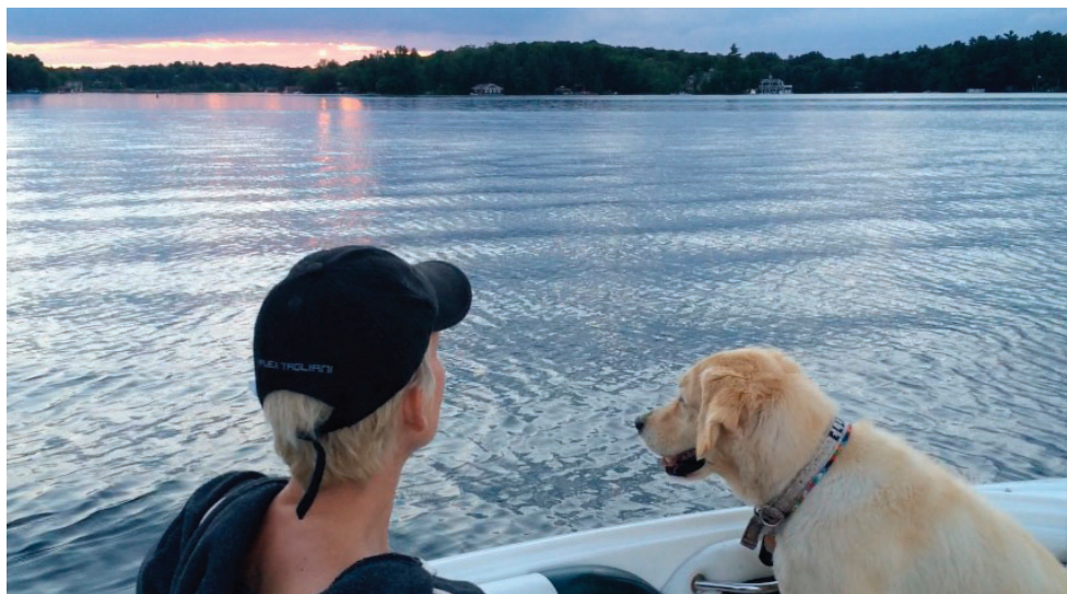
Bear surveys her Muskoka domain from her one of her favourite vantage points.